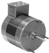
FIG. F D113, D114, D115